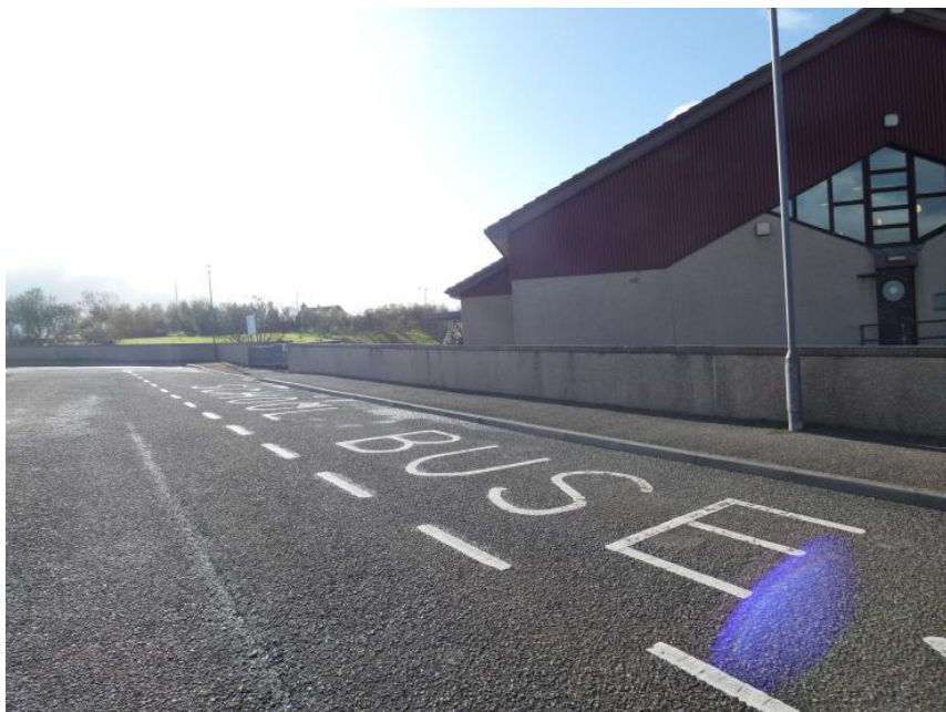
Bus dropping off / pick-up area

Seven cycle parking spaces are provided in the small car park (see photograph above). This may be used in the summer months by older pupils or staff. The janitor supervises any child/ren who has a cycle in the cycle racks in the small car park. He also ensures they get on the main road safely after school once the school buses have left the car park.