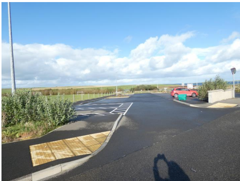
Lower car park with path to main gate

There is also a further small car park into which the rubbish collection lorry comes on Tuesday and Friday mornings. Delivery vans and lorries come to the main entrance and use the bus parking lanes or take the large main gate down and enter the playground. This rarely happens when children are around - but if it does, then the children are directed away from this area by the playground supervisors.