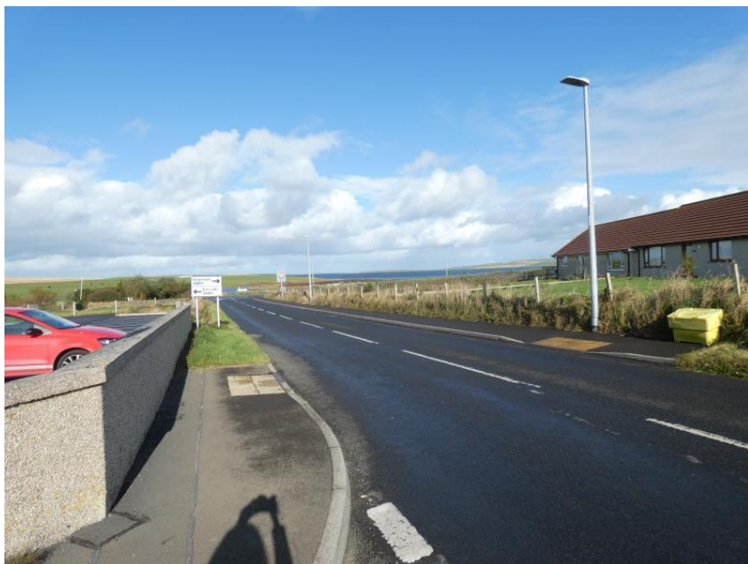
Pavement from the village (B9052)

There is a part-time mandatory 20 mph speed limit on the main Kirkwall - Deerness road (A960) below the school. Light Timings: 8.45am-9.15am and 3.30pm-4.00pm. There is an unsegregated cycle track from the village (A960) leading to the T-junction and up to the school (B9052).