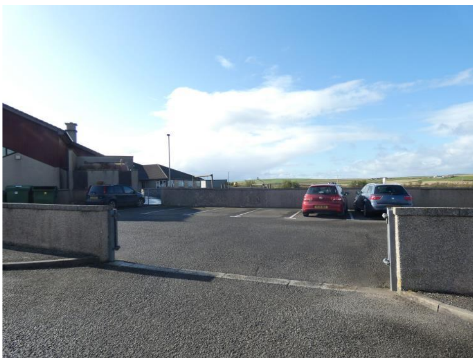
Small car park with cycle parking

There is also a further small car park into which the rubbish collection lorry comes on Tuesday and Friday mornings. Delivery vans and lorries come to the main entrance and use the bus parking lanes or take the large main gate down and enter the playground. This rarely happens when children are around - but if it does, then the children are directed away from this area by the playground supervisors.